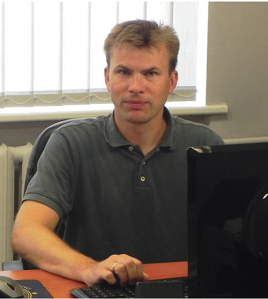
Jānis Grabis, Professor, Dr.sc.ing.

Northern Europe lies within two hours flying time. Latvian companies have developed such products as business process and software modeling tools, Mobile ID, multi-media based e-learning solutions, translation tools and microwave link solutions. Integration of software, hardware, communications, knowledge and supporting services is a characteristic feature of these products. The Latvian companies also provide data storage and cloud computing services.